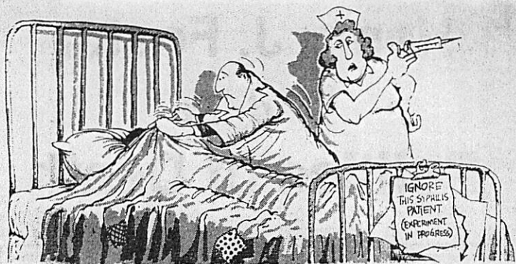
'NOW can we give him penicillin?'

"The present education conventions fade from their minds, and unhampered by tradition, we work our own good will upon a grateful and responsive rural folk. We shall not try to make these people or any of their children into philosophers or men of learning, or men of science. We have not to raise up from among them authors, editors, poets or men of letters . . . The task we set before ourselves is very simple as well as a very beautiful one, to train these people as we find them to a perfectly ideal life just where